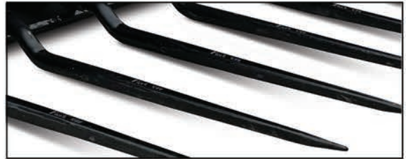
35" Conus 1 Cranked Tines