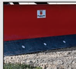
Two Hardened Steel Reversible Cutting Edges