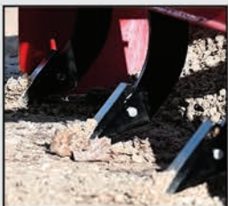
Adjustable Steel Digging Shanks with Replaceable Teeth